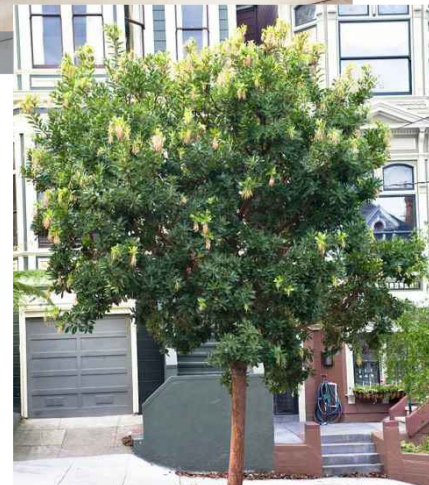
ARBUTUS MARINA TREE