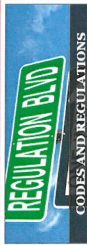
CODES AND REGULATIONS