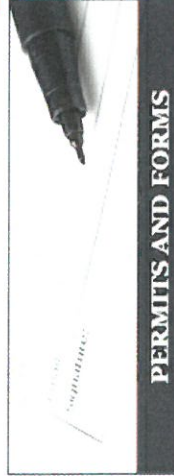
PERMITS AND FORMS