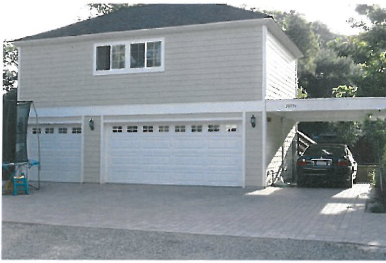
Lot 217 (3) Car Garage (1) Covered Carport Proposed Living Space above Garage - Front View