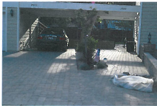
Carport Left side