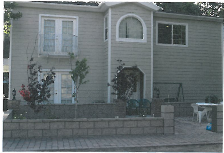
Lot 216 Main House Front View